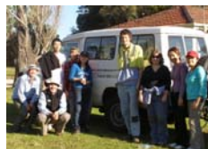
The CVA Team