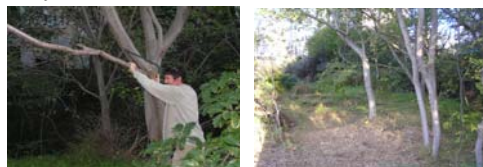
Will Smith working in the woodland

Will has also recently been busy around the grounds of the National Trust Centre, maintaining the hedges and trees and clearing dead branches and debris that had accumulated in the small patch of trees at the rear of the grounds - our very own oasis of woodland in the CBD.